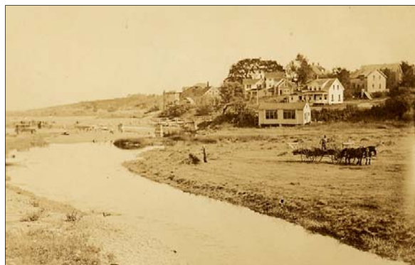
Turn of the century (Late 1800s to early 1900s) views of the old bridge (top) and 'loadin' up hay on the maash.'