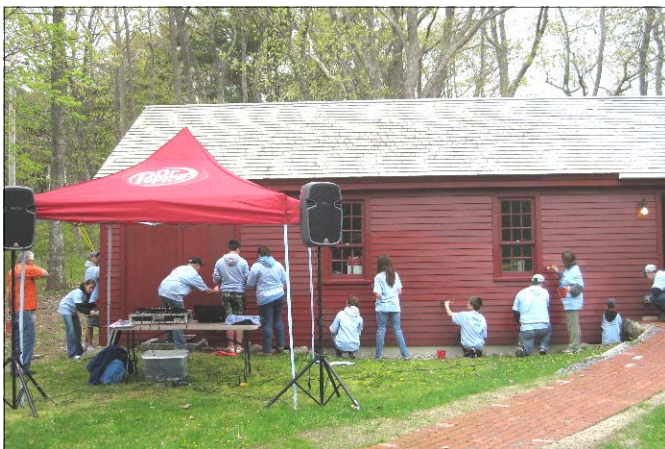
The 'Pepsi Painters of Portland' with a little help from Dr. Pepper and a lot of red paint, covered the entire Winn House on Saturday, May 14 in 4 hrs flat, ahead of the rain.